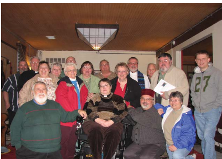
Group Shot of Retreatants